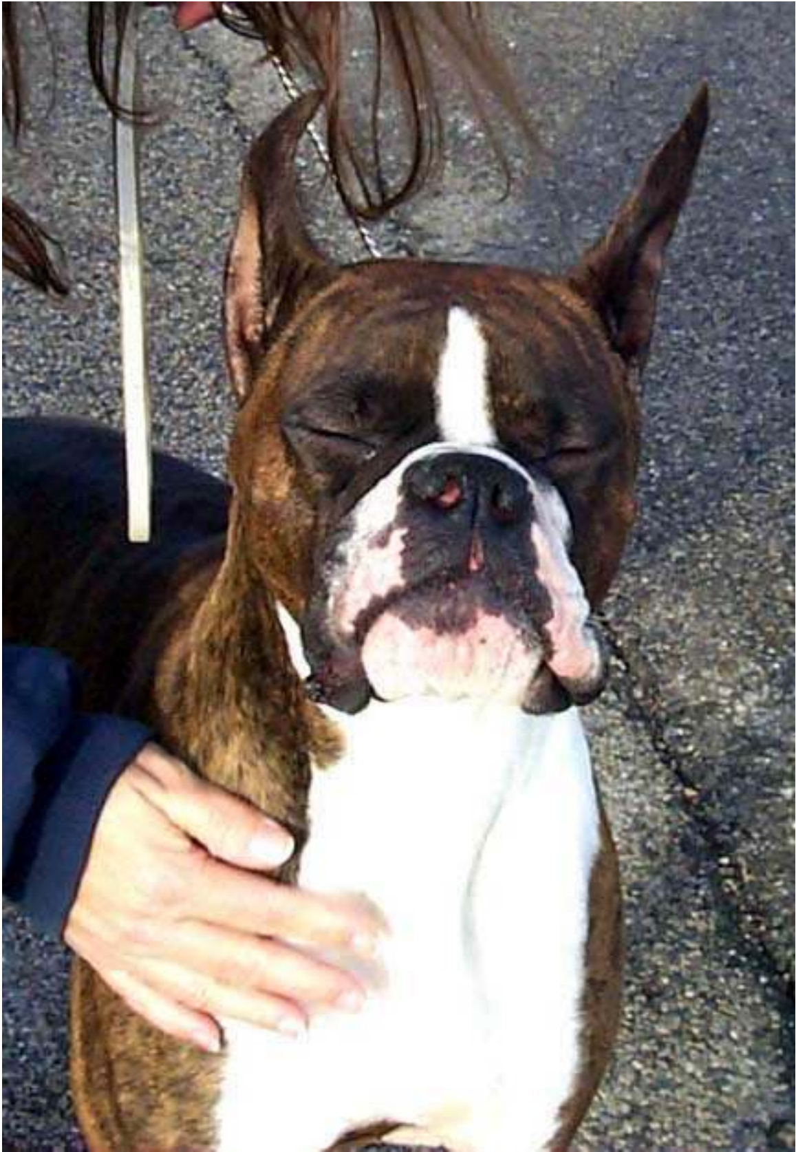
Same bitch as page 2 closeup.