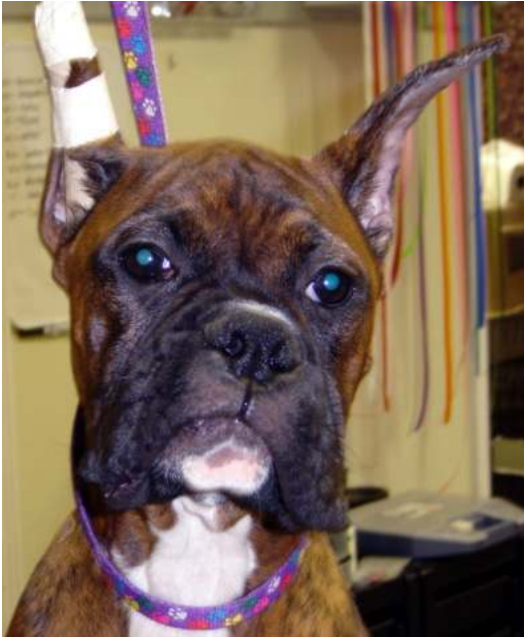
This dog got worse and has trouble eating as an adult.